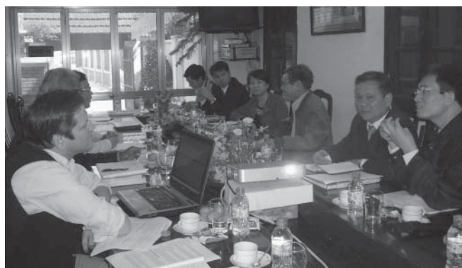
Second Vietnam National Consultation, Statement Drafting Team, 3-4 March 2008, Hanoi