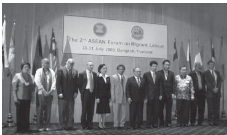
2nd ASEAN Forum on Migrant Labour 30 - 31 July 2009, Bangkok, Thailand hosted by ASEAN Secretariat and Thai Ministry of Labour

ASEAN Committee on the Implementation of the ASEAN Declaration on Migrant Workers .....126