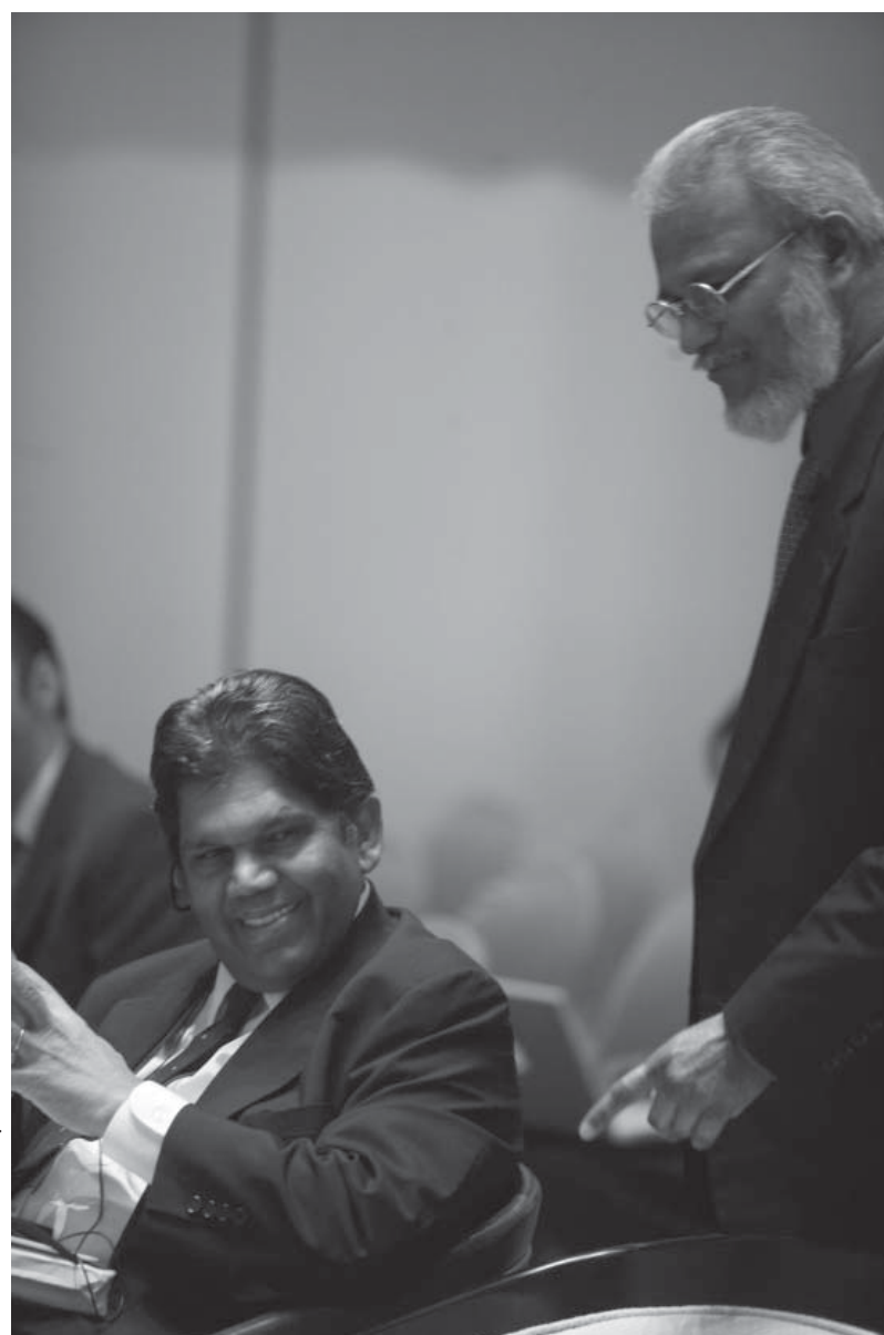
At the International Conference on Human Rights of Migrants and Multi-cultural Society (Seoul, Korea, 10–12 November 2008.).